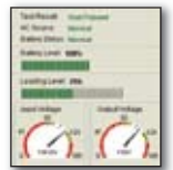
Power Management Software